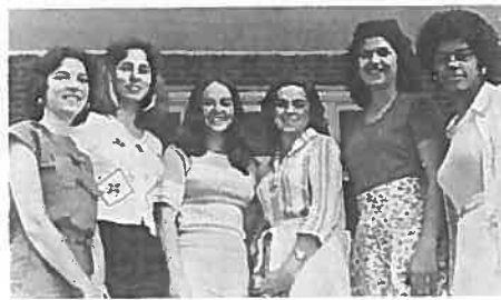
Officers of the University of Mississippi Chapter of Alpha Lambda Delta, 1976-1977.