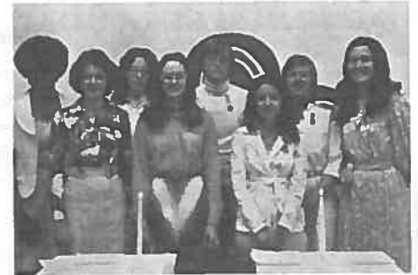
Newly-initiated officers of Alpha Lambda Delta's one hundred and ninety-fourth chapter. Installation took place at Georgia Southwestern College at Americus, Georgia on November 18, 1976.