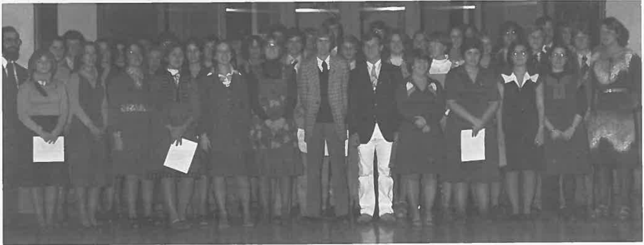
Student charter members of the Susquehanna Chapter, Alpha Lambda Delta