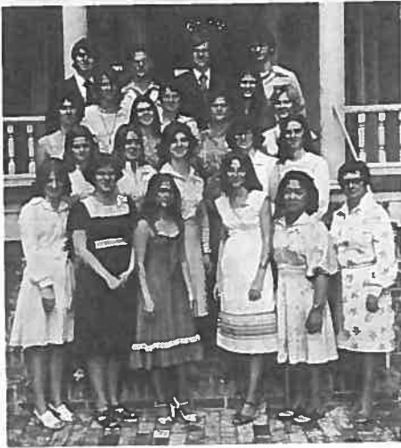
Initiation luncheon picture taken of the University of Alabama chapter in Huntsville.