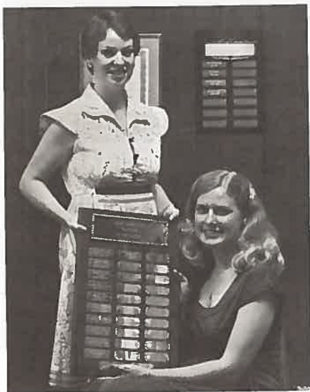
UNIVERSITY OF SOUTH ALABAMA Mobile, Alabama