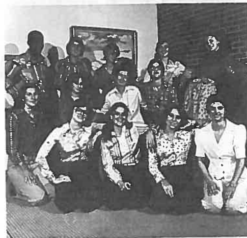
The Wichita State University chapter has only one male member so far, and is pleased at the example set by the international student from Nigeria.

The Ohio University chapter was reactivated last year after a two-year absence on campus. Alpha Lambda Delta at Ohio University hopes to get into full swing this year after the initiation of 150 new members last winter and spring.