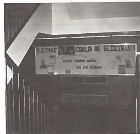
Eye-catching display of honor societies in the Western Michigan University Student Union.

Another task of Alpha Lambda Delta is to promote the honor organization campus-wide and to make students more aware of the existence of Alpha Lambda Delta. This can be accomplished several ways and the way found to be the most successful and informative is through bulletin board displays in the WMU Student Union. The display created winter 1977 semester proved to be the most "eye-catching" bulletin board yet, but just wait . . . There are some plans for an even better display during the busy winter semester of 1978!