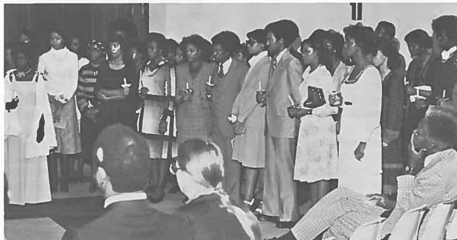
Partial group of initiates at the installation of the chapter at Jackson State University, Jackson, Mississippi.