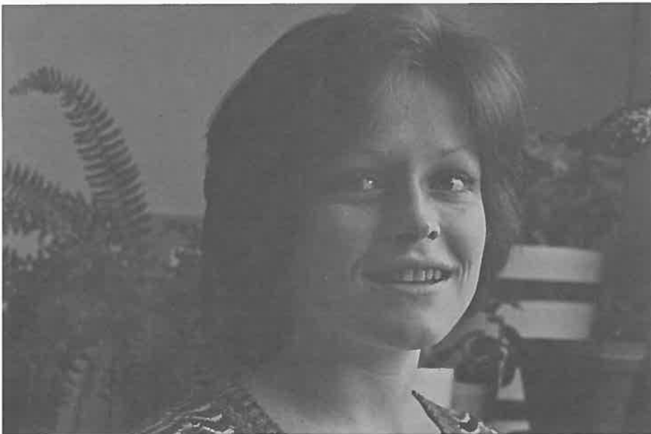
(Continued from page 1)

Lynn hopes to pursue a doctoral program in medieval studies and will study for the B.A. in classics at Oxford.