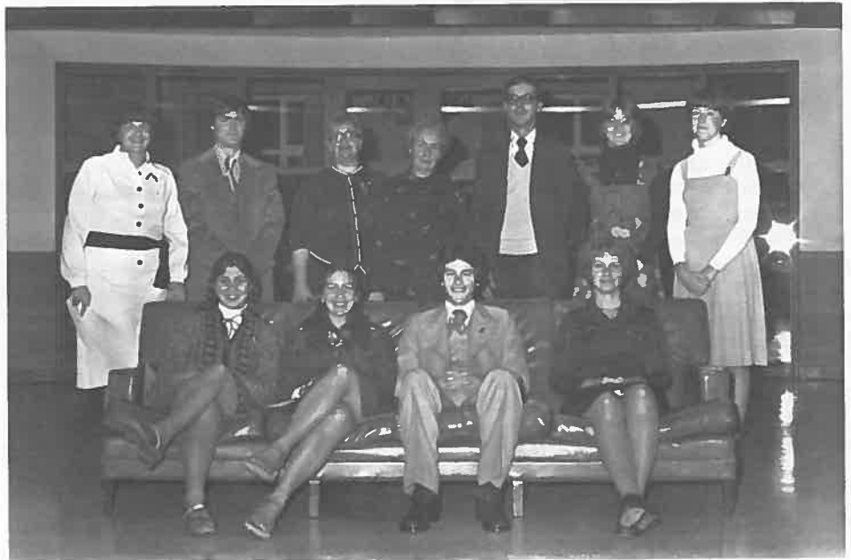
Charter officers and participants in installation of Susquehanna University Chapter.