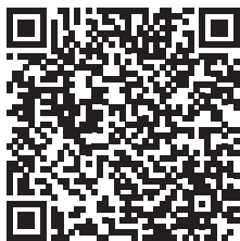
CSU Monterey Bay