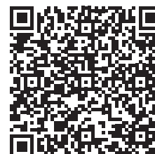
Sam Houston State